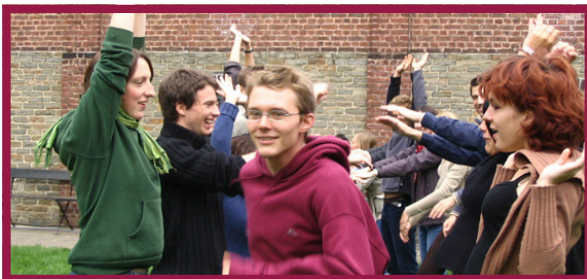
Funding example: International training of students