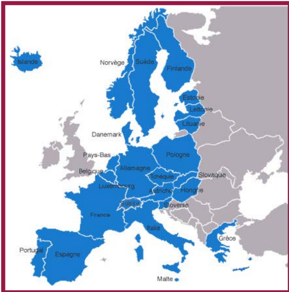
Member countries of the European Union eligible for Community Outreach Programmes

These are all programs that allow you to finance your projects within the European Union, for organizations located in the EU area in partnership with at least one organization from another member state.