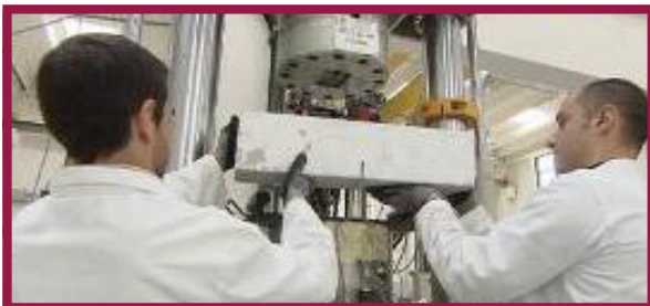
Funding example: control surface and ground water pollution

The new 2021-2027 program will bring new perspectives.